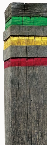
Marker posts with different coloured symbols mark the hiking routes in Sybergländ.

PLEASE NOTE: THERE IS NO ACCESS TO THE CATTLE FOLDS. DOGS MUST ALWAYS BE KEPT ON A LEAD.