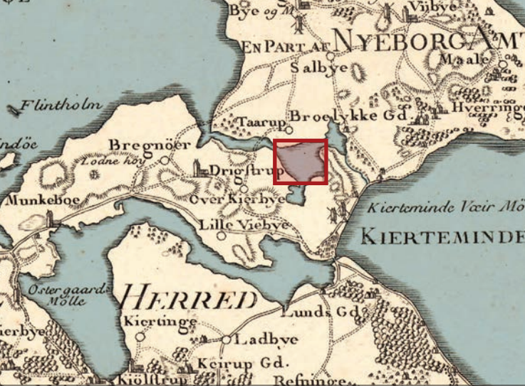
Videnskaberne Selskabs Kort (the scientific society's map) 1780. A shallow arm of Odense Fjord separates Hindsholm from the rest of Funen. When it was drained in 1812, it provided farmland but at the cost of its original nature. The red square shows the boundaries of Sybergländ as they are now.

Including: Sybergländ has a spacious building with information boards and facilities for eating, shelters and no less than two birdwatching hides.